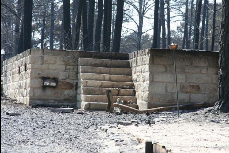
LOCAL, TDEM & FEMA DAMAGE ASSESSMENTS